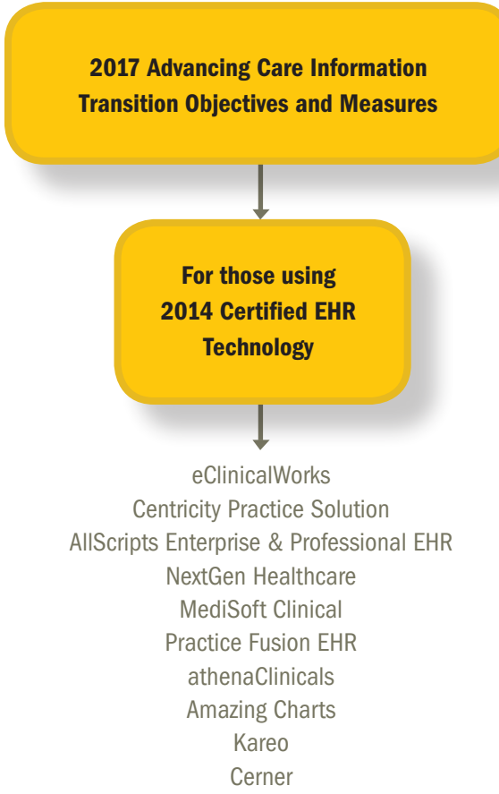
See page 2: "For those using a 2014 EHR Edition"

In 2017, there are two measure sets for reporting based on EHR edition. See below to determine which measure set you should use: